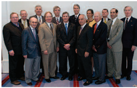
SAGES Past, Current and Future Presidents gather for a photo op during the annual meeting.