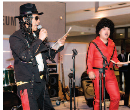
The World Congress culminated Saturday night with a Gala at the Newseum in Washington, DC. While the International Sing-Off took a hiatus, SAGES friends and colleagues from Japan entertained the group with "We Are the World Congress"!