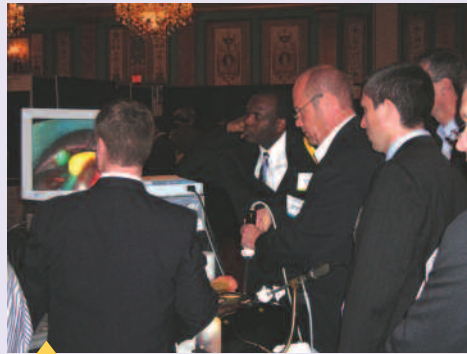
A meeting attendee practices a procedure at the Learning Center.