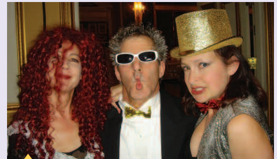
"Rocky Horror" comes to SAGES.