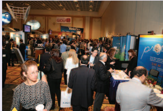
Attendees explore the Exhibit Hall.