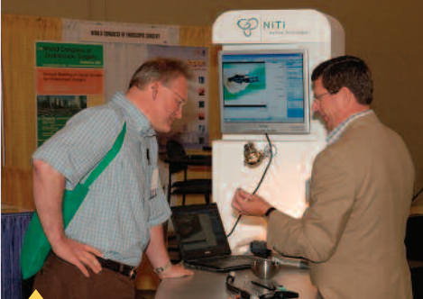
A meeting attendee learns about a company product at the Exhibit Hall.