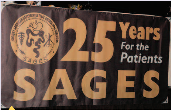
SAGES celebrates 25 years of Advancing Surgical Excellence during its Annual Meeting in Dallas, TX.