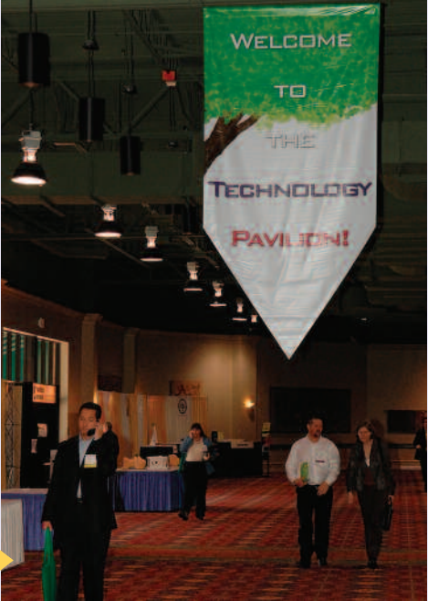
The Technology Pavilion demonstrated some of the most emerging platforms in laparoscopic surgery.