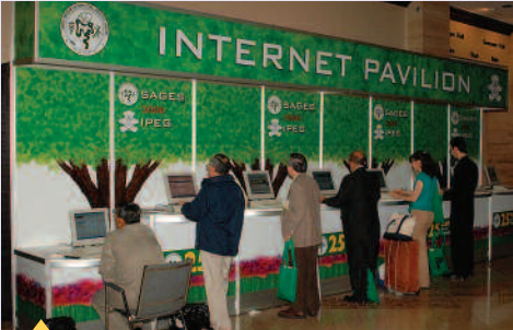
Meeting registrants make sure to keep in touch while learning the most advanced surgical techniques.