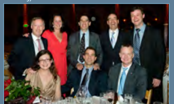
SAGES 2013 Presidents' Dinner