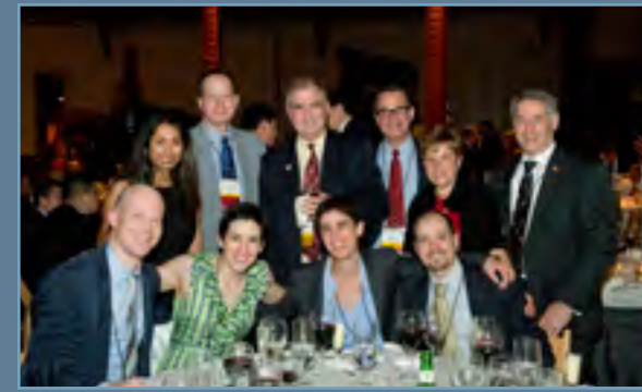
SAGES 2013 Presidents' Dinner